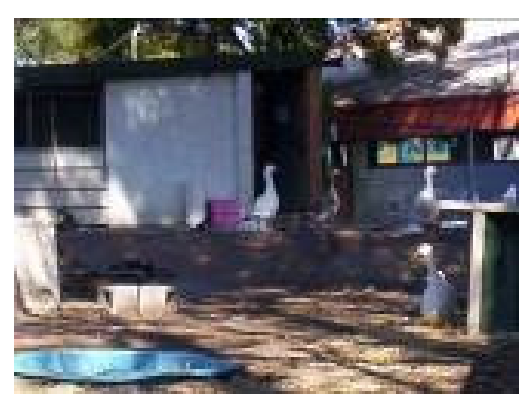
The environment in which animals are housed needs to be varied and rewarding

By providing environmental enrichment we can reduce stress that the animal may experience, as well as provide occupational therapy.