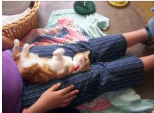
Social time with my human counterpart's is vital for my well being