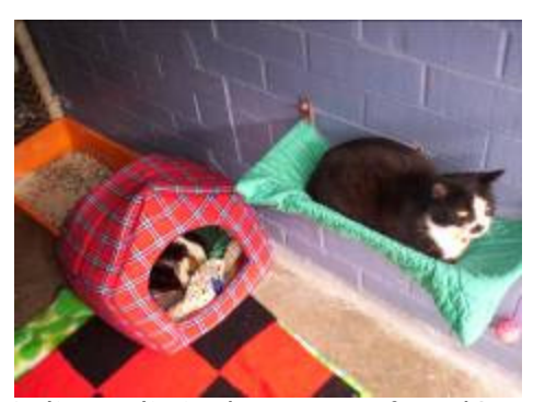
A sling to lie in, keeps me safe and I can view the world better.