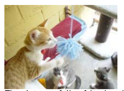
Then let your feline friends enjoy!