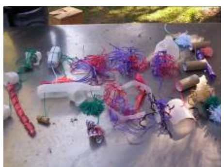
Ribbon, corks, string, wool, toilet rolls All of these can be made into cat toys.