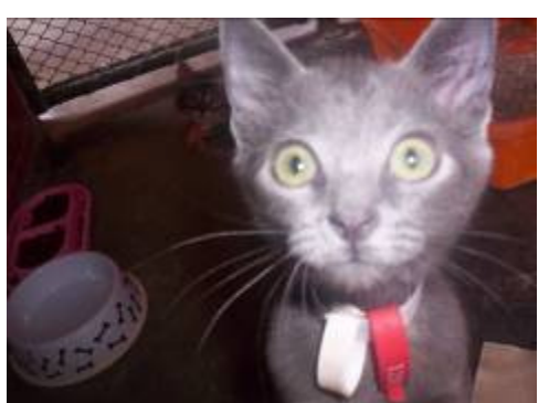
Social contact with humans is very important for my development