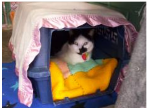
A place to hide to make me feel safe when I am not sure of my environment.