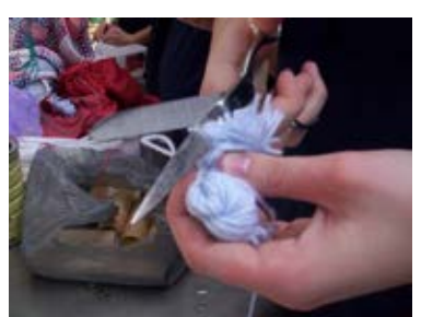
so the wool fans as above.