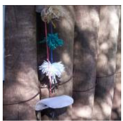
Some wool, string, a pom pom and an ice cream lid.