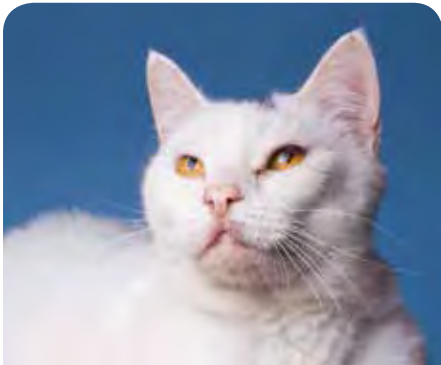
PIONI ID 881316

All our dogs and cats are desexed, microchipped, vaccinated, wormed and health checked.