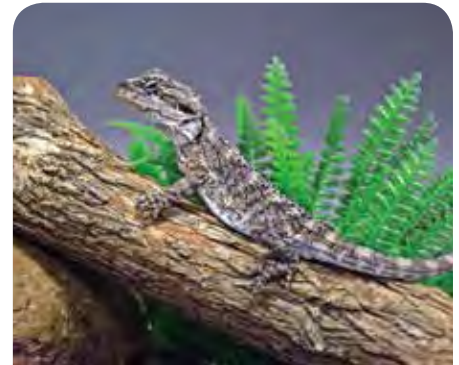
SPYRO ID 881970