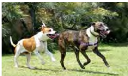
Dahlia's profile: www.bit.ly/rspca629396 Ruben's profile: www.bit.ly/rspca623823