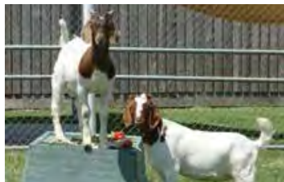
Jam's profile: www.bit.ly/rspca900247 Doughnut's profile: www.bit.ly/rspca900251

There's a bonded trend developing among the population at the Wacol RSPCA Shelter they are proving to be double the fun.