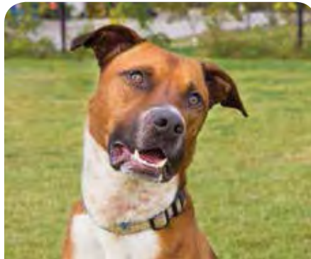
BLAZE ID 809460