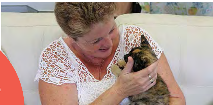
Coral is enjoying cuddles while waiting for a new home. Visit Coral's profile: bit.ly/rspca878237