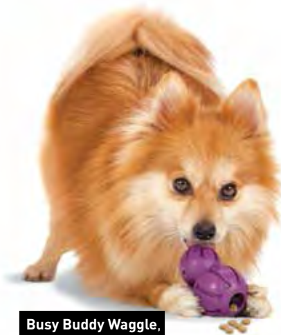
Busy Buddy Waggle.

The Busy Buddy range is available at World for Pets instore or online at www.worldforpets.com.au .